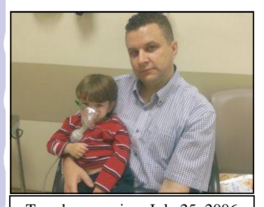
Tuesday morning, July 25, 2006

making it known to these families that it is the love of God that had moved people from thousands of miles away to reach out to them. Also pray that the local church will help by showing them love and feeding them the Word so that much fruit will be produced.