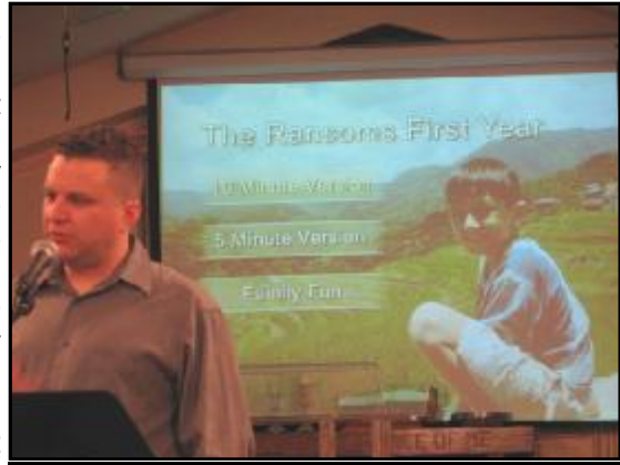
We also spoke at Cornerstone International Church, a Filipino congregation in La Puente

our 5 weeks in the US, we got to visit 7 different churches, about our ministry at several of them, and enjoy visiting with many of our supporting families. We also took advantage of "vacation time" and spent a couple of weeks with our parents, siblings, and